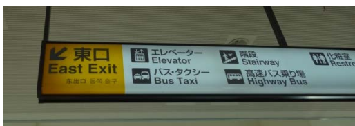
East Exit at the Tokai-station

Arriving at the Tokai-station, proceeds to the East Exit to take a bus for the Nuclear Science Research Institute.