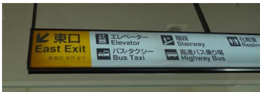
East Exit at the Tokai-station

Arriving at the Tokai-station, proceeds to the East Exit to take a bus for the Nuclear Science Research Institute.