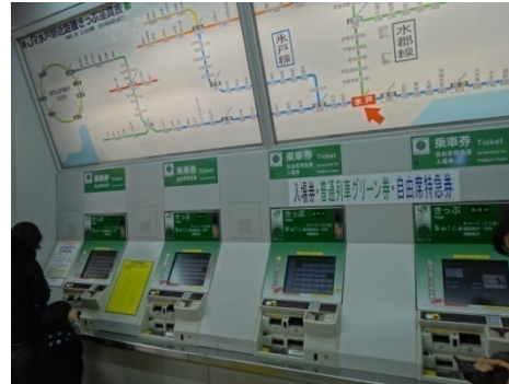
Entrance to the platform at the Mito-station