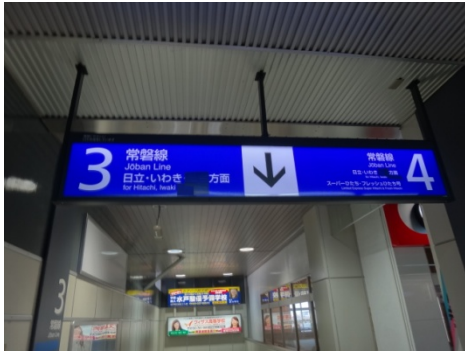
Ticket machine at the Mito-station