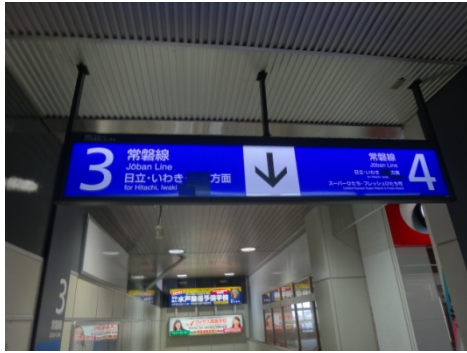
Entrance to the platform at the Mito-station

Those who will stay at Mito-city are expected to use a train (East Japan Railway company: JR-East) to come to Tokai-station. The name of the line you should take is called “ Joban-line ”. Please take the train for Takahagi or Iwaki . The time table is as follows. Some trains terminate at Katsuta and are not shown in the table. The train departs from the platform No.3 or .4 (photo). The ticket costs JPY 230 and is purchased at the machine (photo).